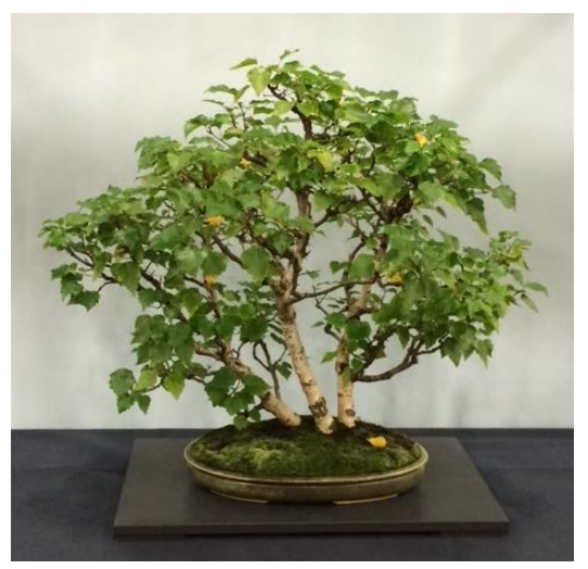
White Birch Clump by Cyril Grum

A single white birch, betula sp., with a white trunk was collected in March 1994 in a wetlands area in southern Michigan. One year later two root suckers sprung up and turned white after about a decade, giving the composition three white trunks. This unusual specimen for bonsai responds well to removing all initial buds in the spring. This birch is displayed in a Joel Sampson container of Copper Crane Pottery, Lanesboro, Minnesota on a wooden stand with black stain by Bill Sloan.